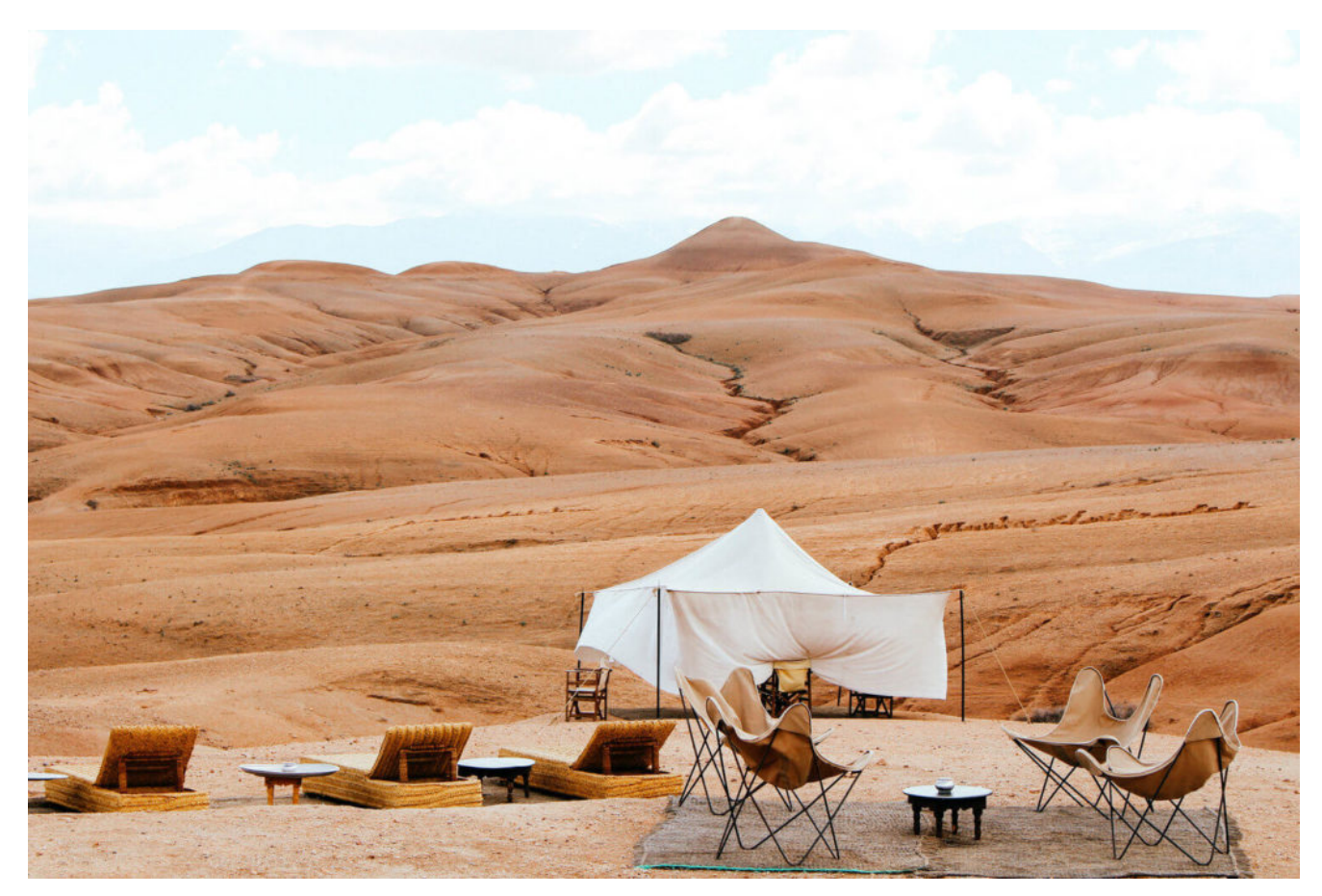
Day 4: MARRAKECH

you will explore Bab Agnaou with entrances to Saadian Tombs and El Badi Palace with tour of the Medina. But before, you will explore Menara Gardens.